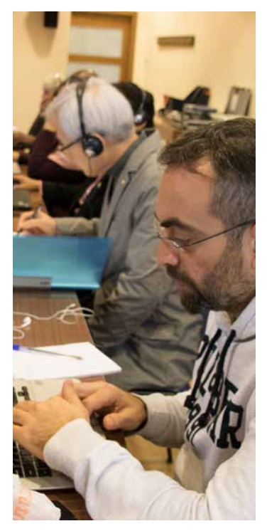
CIOFS Presidency members gathered in Rome from March 18 to 25, meeting from morning to night on the business and spirit of the worldwide Secular Franciscan Order.