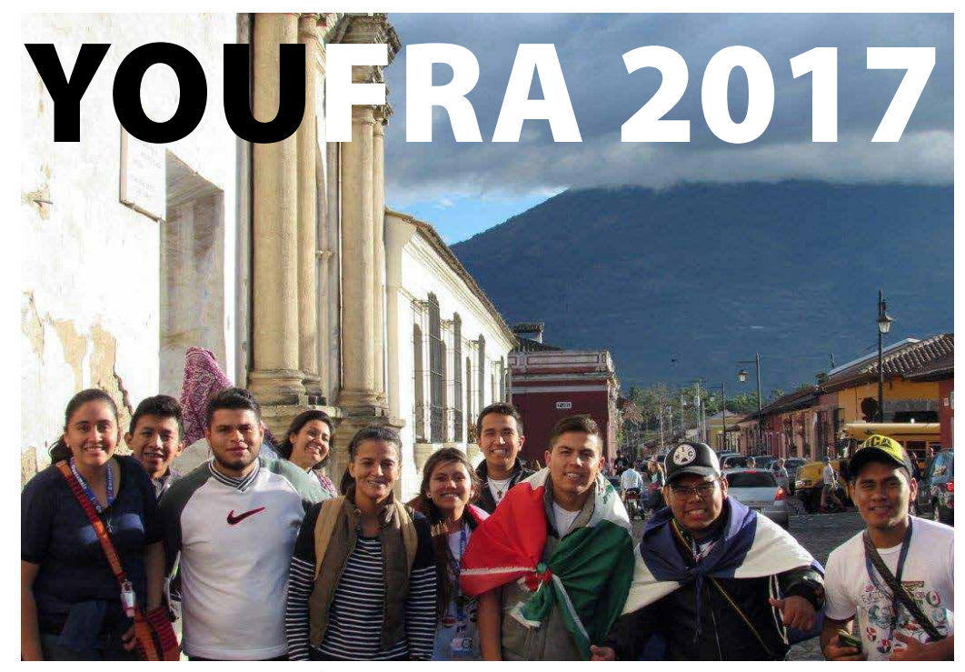
ABOVE AND BELOW: Some of the YouFra participants at the gathering in Guatemala.