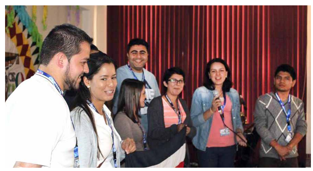
VOX Franciscana • 2 • Spring 2017