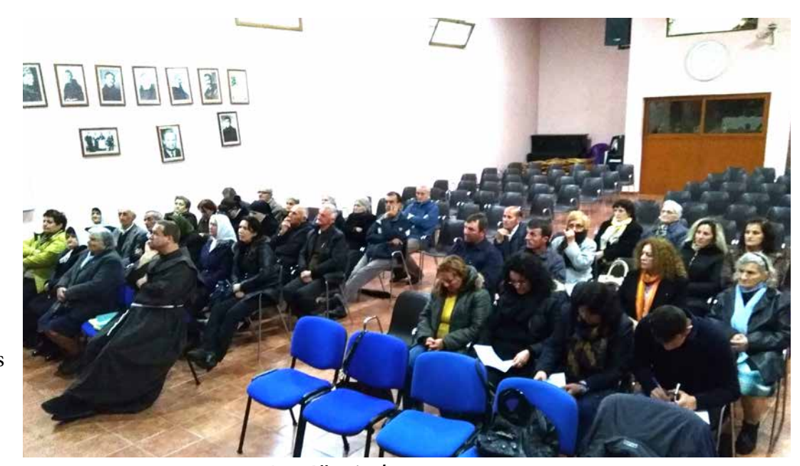
Delegates and observers attend the Albania chapter.

The visitors were hosted by the Capuchin Friars at the convent-church of "Cristo de Limpias" in the old Havana quarter. Most of the meetings were held at the Church of Saint Francis in the historical center of the city, managed by the OFM Conv. Friars. The visitors held